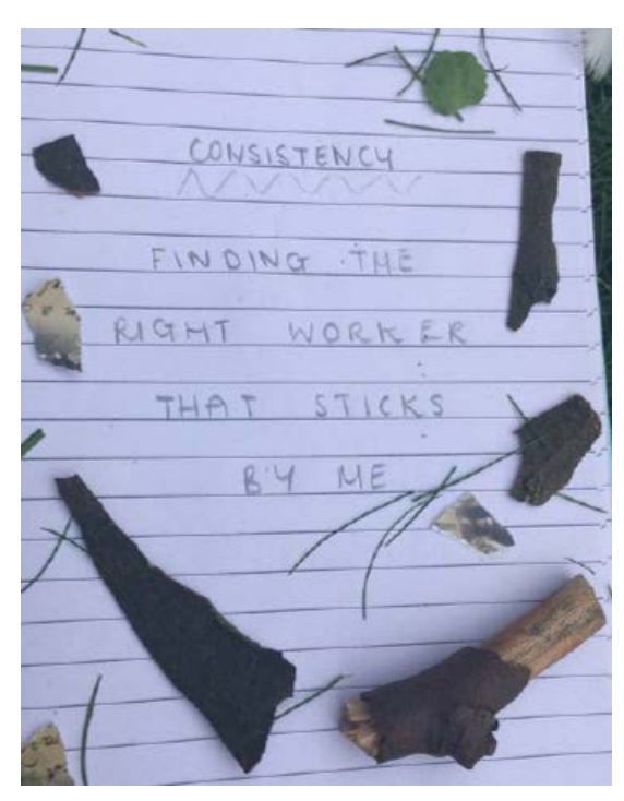
Young person from the SCIE group

For children and young people in our engagement activities, the professionals working with them had the biggest impact on their experience of care. This was referenced across all services including schools, hospitals, CAMHS services and GP practices.