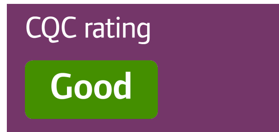
Filename: CQC rating good PURPLE Available formats: EPS